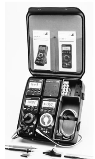
F840 (with sample contents)