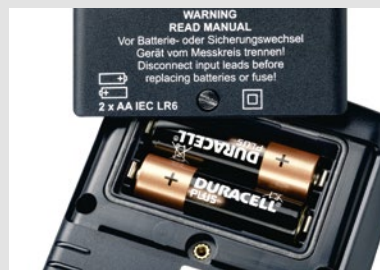
Separate battery compartment