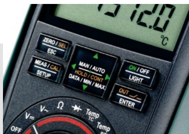
Convenient operation with keys and cursor field