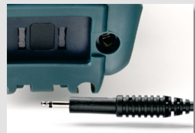
Connector jack for external power pack