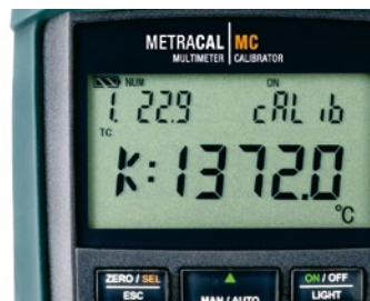
Multiple display, e.g. functions and output value or measurement and simulation values etc.