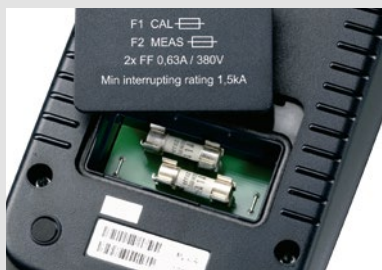
Separate fuse compartment