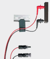
Magnetic Test Probes with MC4 Plug (Z502Y)