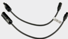
MC3 – MC4 PV Adapter Set (Z360K)