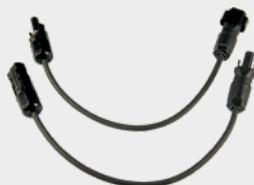
SUNCLIX – MC4 PV Adapter Set (Z360H)