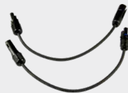
TYCO – MC4 PV Adapter Set (Z360J)